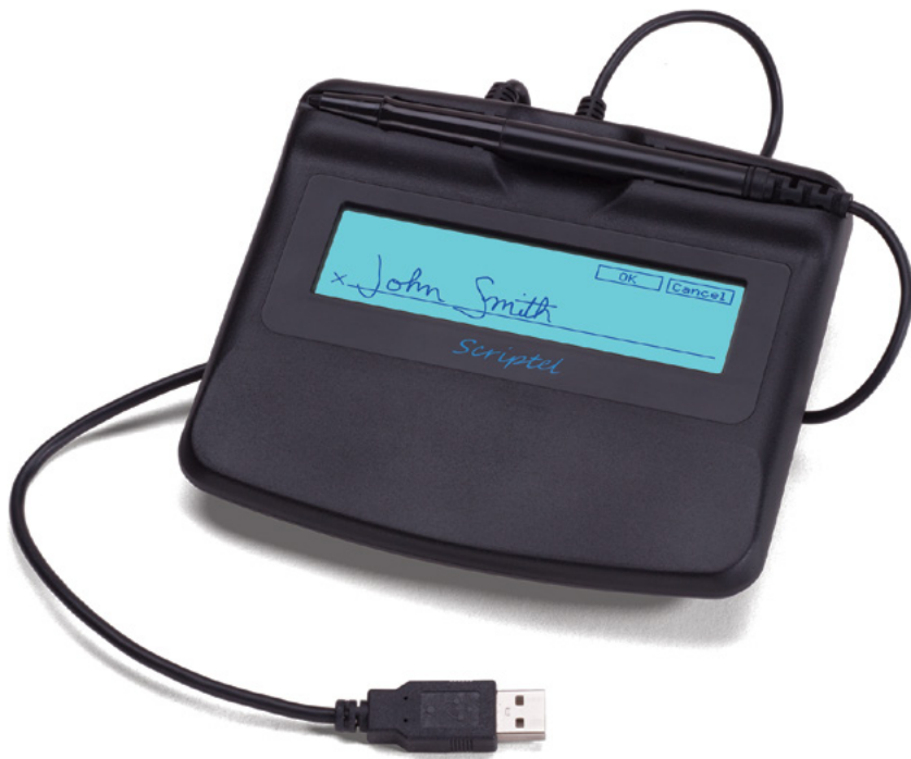
Scriptel ScripTouch Slimline LCD

“Scriptel’s support during the buying and implementation process was great. They even bought one of the software clients we use so they could find solutions to issues we were having on our end.”