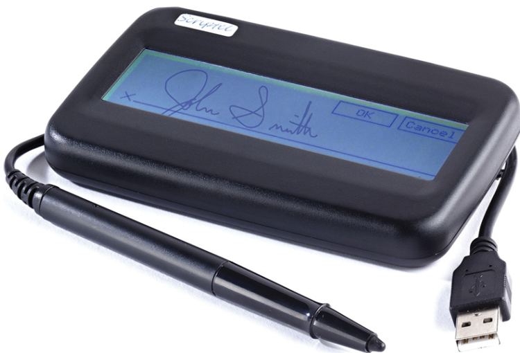
Product Selected: Scriptel's Compact LCD, model ST1551

"Implementation and Installation was painless. Scriptel's plug and play USB solution lets us move the signature pad from computer to computer with no issues."