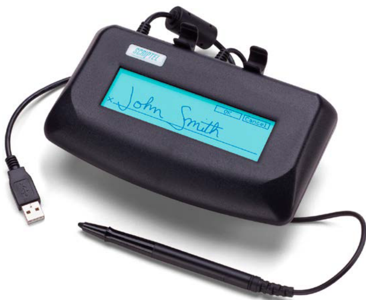
Scriptel Compact LCD Model ST1500B

"We can't thank Scriptel's expert support team enough for their responsiveness throughout the entire process. They always responded to our questions in a timely manner during the testing, buying and implementation process. We now plan to move forward in purchasing more pads for our hospitals."