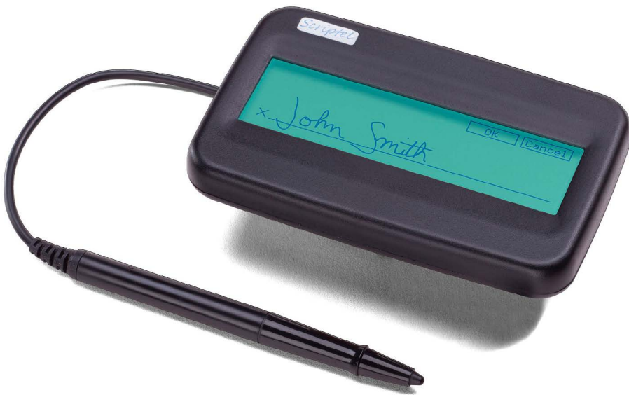
Scriptel Compact LCD ST1550 chosen by Nationwide Children's Hospital, Columbus, OH.

"Up until 2016, we didn't know there were other vendors out there who could offer us an Epic compatible eSignature device."