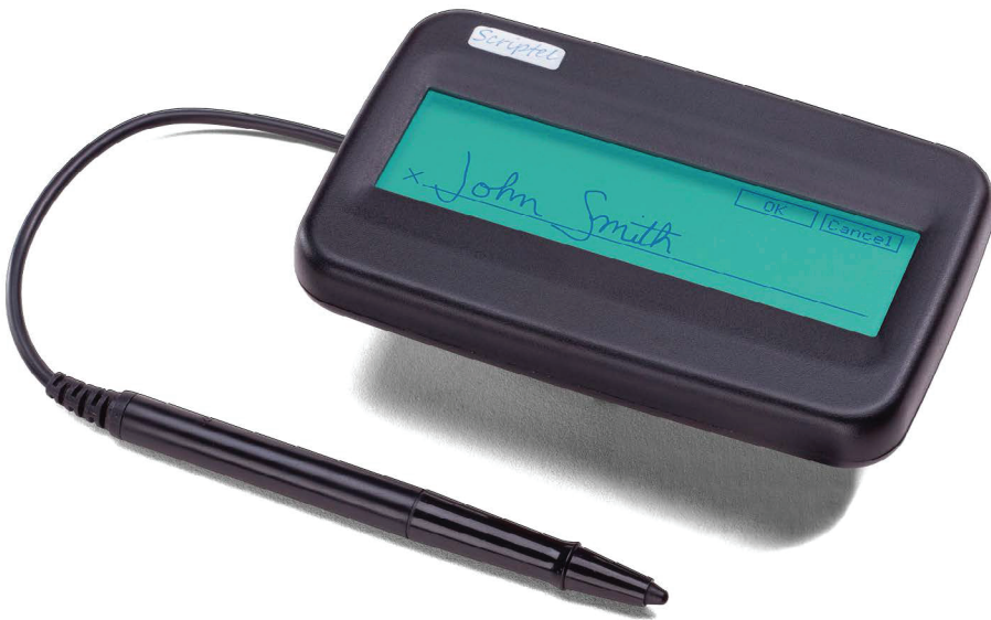
Scriptel Compact LCD ST1550 chosen by Nationwide Children's Hospital, Columbus, OH.

"Up until 2016, we didn't know there were other vendors out there who could offer us an Epic compatible eSignature device."