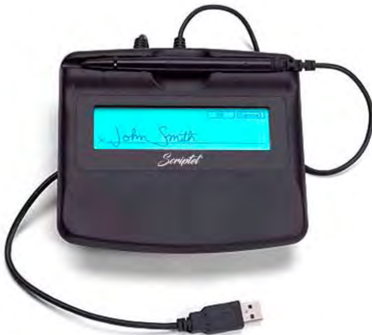
ScripTouch Slimline LCD ST1570 ProScript with 6ft cords

“At the time I wasn’t aware of another vendor who manufactured eSignature devices that were compatible with Epic software.”