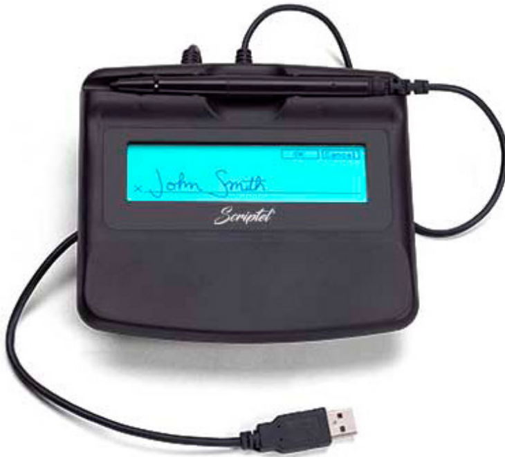
ScriptTouch Slimline LCD ST1570 ProScript with 6ft cords

“At the time I wasn’t aware of another vendor who manufactured eSignature devices that were compatible with Epic software.”