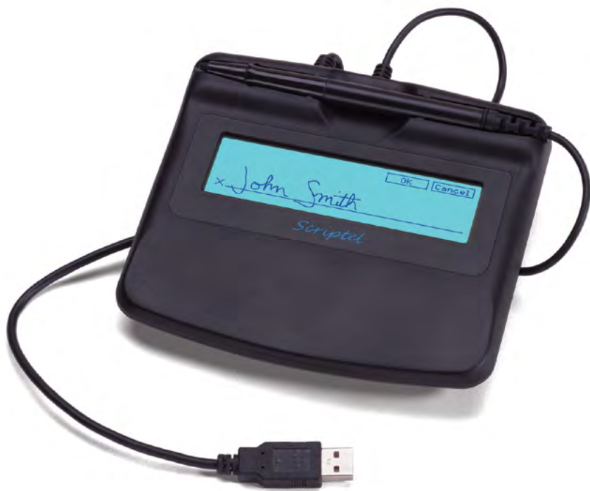
Scriptel ScripTouch Slimline LCD

“Scriptel’s support during the buying and implementation process was great. They even bought one of the software clients we use so they could find solutions to issues we were having on our end.”